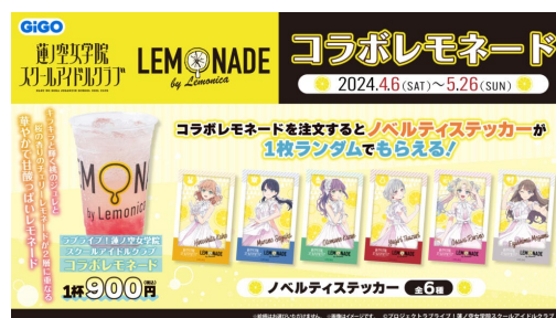
Ongoing collaboration campaign