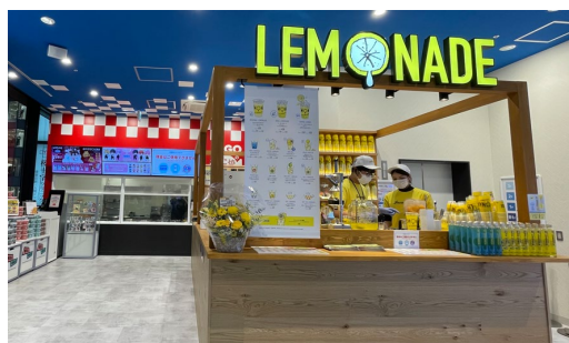
LEMONADE by Lemonica opened at GiGO Sohonten

LEMONADE by Lemonica, a stand-type lemonade specialty store operated by our group company Lemonade Lemonica, Inc. opened at the "GiGO Sohonten," on Monday, April 1. LEMONADE by Lemonica, which opened on the second floor, has already become popular as a new communication spot, where customers can take a break between games, meet up, or show off their prizes to each other. In addition, "LEMONADE by Lemonica" stores, which are located in about 50 stores in Japan, will launch "LOVE LIVE! HASU NO SORA JOGAKUIN SCHOOL IDOL CLU" collaboration at about 50 "LEMONADE by Lemonica" stores in Japan since Saturday, April 6, and many customers have been coming to the GiGO Sohonten store to enjoy the collaboration lemonade.