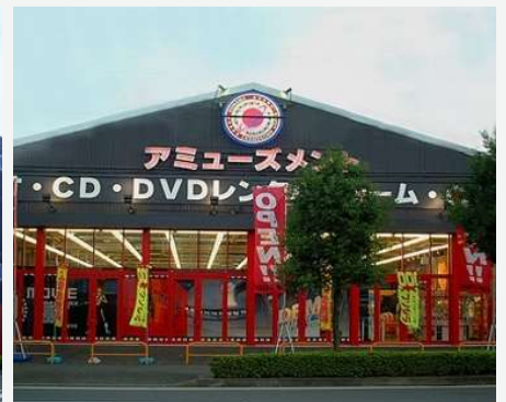
DORAMA Kohoku Interchange