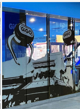
Glass walls on the 1 st floor