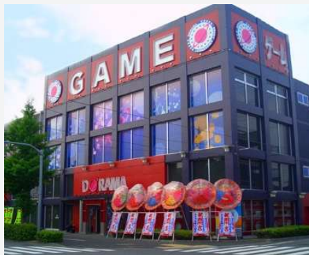
DORAMA Hachioji Takakura