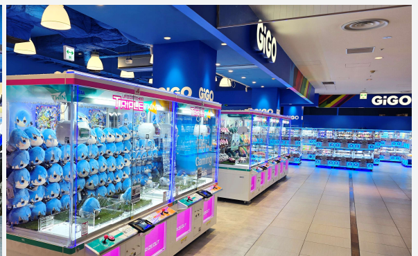
GiGO NU Chayamachi